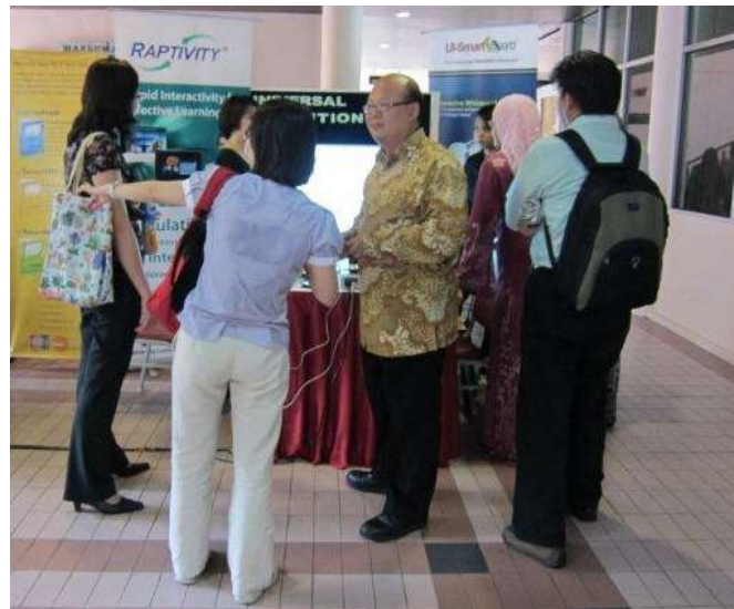
RIGHT: Visitors @the eLearningMinds Exhibition Booth, USM, 4 th July 2011

eLearningMinds recently participated in the e-Learn@USM organised by the Division of Academic and International Affairs, USM, and Center of Knowledge, Communication and technology, USM. It was held on the 4 th of July, at the Dewan Budaya of University Sains Malaysia.